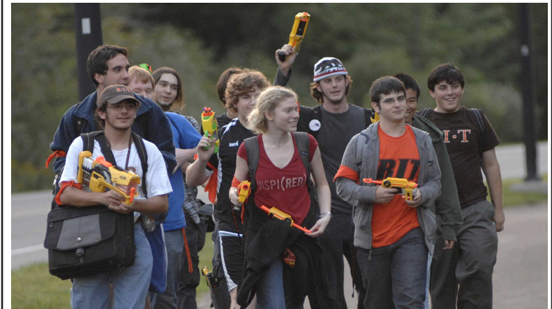
Warning- Nerf-guns not yet allowed. YET!!!