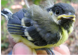
One of many great tits.