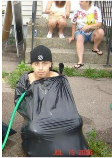
In other news, "Extreme NSF Condom Experiment Fails."