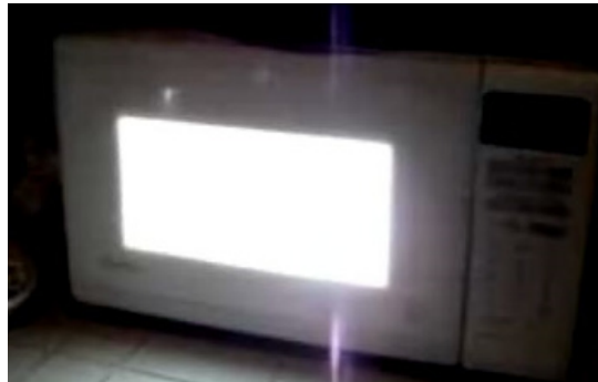
Microwave super-critical. Exploding in 3... 2... 1...

flaming microwave first hand, got a few words in as he was rushed off campus for burn treatments, "It really was a stupid thing for me to do. I was a little drunk, and my burnt popcorn scared me a little, so I chucked the microwave out of the window."