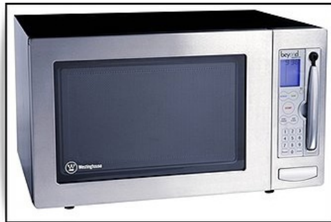
This microwave tells you when YOU're done.

Due to the seriousness of this tragedy a school-wide meeting was held the next day in Fisher 135. The entire lecture hall was packed with concerned students and staff. "We actually did not